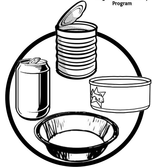
Metal Cans, Pans and Tinfoil

Rinse, wipe or scrape out food and place loosely in your bin, without a bag.