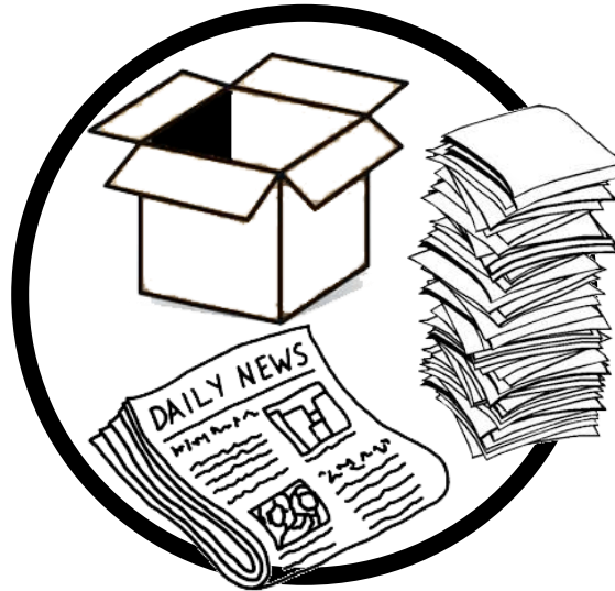
Paper and Cardboard