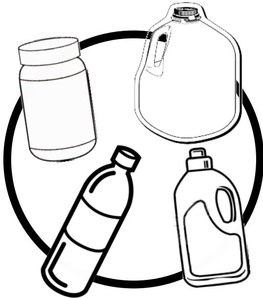
Plastic - Bottles, Jars and Jugs Only